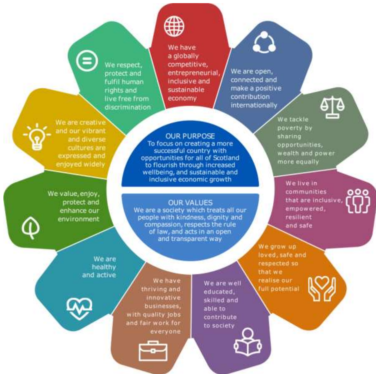
The purpose, values and national outcomes of the refreshed National Performance Framework

As part of our first Open Government Action Plan, the revised National Performance Framework was matched up to the United Nation's Sustainable Development Goals , because those are aimed at improving wellbeing across the world. This means we can see how we compare to others and how the decisions we make in Scotland affect people in other countries.