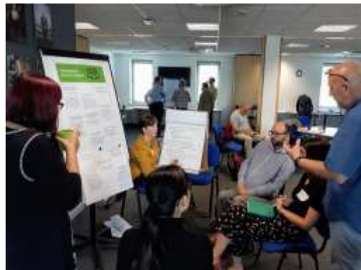
People taking part in a public discussion event, developing actions to create the Open Government Action Plan